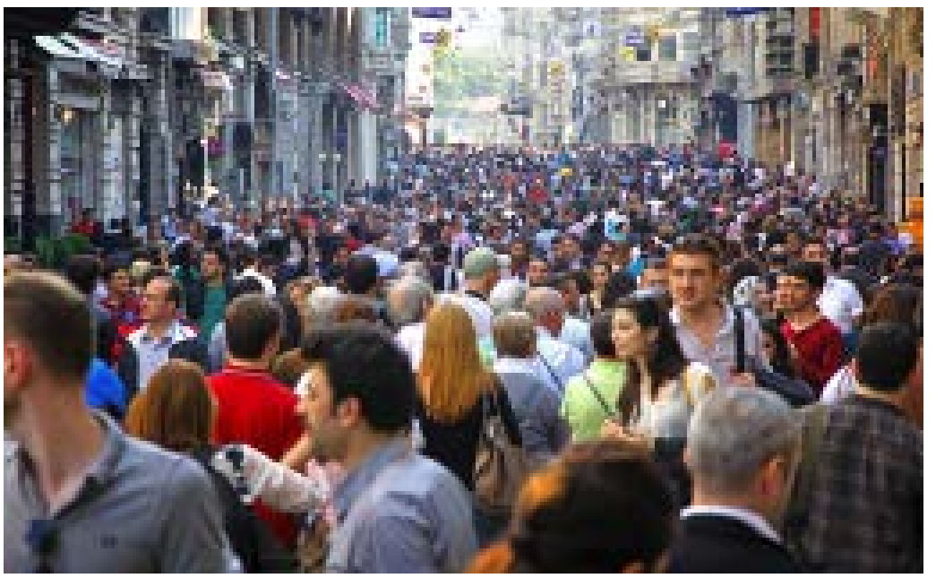
Thousands have had near death experiences.

For decades these NDEs were given little or no weight by the scientific community. They were considered “woo-woo” despite the voluminous reports to the contrary. Neurosurgeons, in particular, downplayed the phenomenon. In lay terms, they claimed that these experiences were caused by the activation, as death nears, of that portion of the brain responsible for hallucinations. Thus, the neurosurgeons claimed, these visits with the Divine were merely delusions, not to be taken seriously.