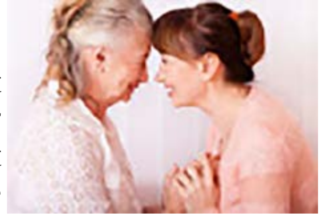
Trust is an essential component of love.

Trust is something we develop with experience. For example, we don’t completely trust that we can hit a baseball or ride a bicycle or perform other tasks, until we do so. We may not completely trust other people until they prove their trustworthiness and we don’t completely trust The Unseen Therapist until we have personal evidence that She is real.